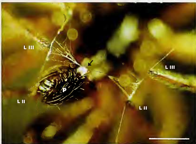
Figure 2.—Male loading one of his pedipalps with sperm from the sperm web. P: pedipalp; L II: leg II; L III: leg III. The arrow points to the sperm drop. Scale = 0.5 mm.

Because sperm induction is essential for successful copulation, it is surprising that there are few studies describing it in detail. In this species, this behavior always took place shortly after copulation.